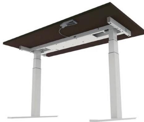
Optional Pneumatic Sit-to-Stand Base!

3" All Locking & Swivel Casters Colored Edge Banding Pneumatic Sit-to-Stand Base: 30"-49" 1 or 2 Flush Mount Electrical (2 AC/2 USB) Storage Bins, Lids, & Dividers