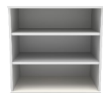
Full Cabinet Shelves