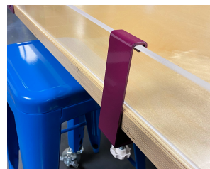
Side Support Clamp