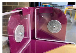
Corner Support & Magnet Connection

Robotics Bumper Kit Shown on Idea Island, but compatible with ED Tables & select Brainstorm Workbenches of 42x72 & 42x84 Metal corner pieces slide onto table corners and polycarbonate sides nest into corners and attach by magnets. Two side clamps also attach to the 72L or 84L sides of table for additional support.